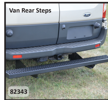
Van Rear Steps

Owens Commercial™ Grip Strut Steps. These Commercial Grip Strut Steps for heavy use are manufactured from commercial grade grip strut aluminum and are powder coated to prevent rust and corrosion. End caps are welded on both ends to add strength and give it a nice finished look. The end caps are also great for vehicles with large fender flares or other obstructions in the wheel wells. The grip strut design on these aluminum steps provides an aggressive sure-foot area for secure stepping all year round. These steps feature easy-to-install body mount brackets for most applications. All applications have been tested to withstand up to 600 lbs and perform day after day on the job.